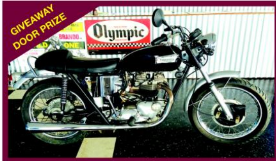
This Triumph 650 motorcycle is the giveaway door prize at the 2015 Laidley Swap. You must be present with a single armband on and I.D. to win this prize. Drawn at 11am Sunday 25th October.

SITE BOOKING NOT REQUIRED Entry Times: Vendor entry 4pm Friday and 5am Saturday Gates open general public 6am Saturday and Sunday. Entry Prices: Vendor Site $5, Friday night vendor and Sat/Sun entry $10 per person (free camping onsite available) Sunday entry $5 per person