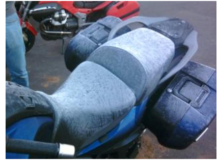
Above: That's frost, not rain!!